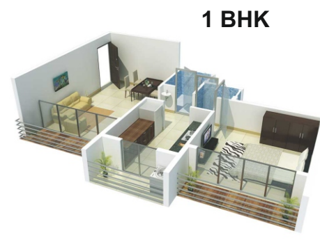
Artistic Impression Image