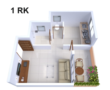
Artistic Impression Image

· Concealed copper wiring with adequate points for A/C, Refrigerator, Geyser, TV, Cable and Telephone etc.